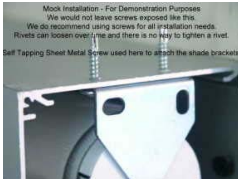
Click Picture for Larger Image

Comment: You might think attaching the brackets to the end plates might be better if you are using end plates but you may run into a problem if the assembly is not level. With the brackets mounted to the ceiling of the pocket you can shim the bracket heights incase you have material walk-off issues.