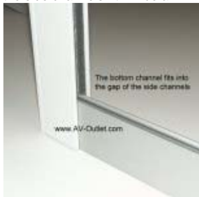
Click Picture for Larger Image