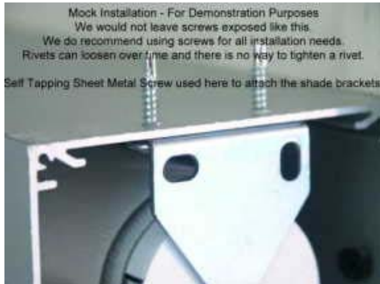
Click Picture for Larger Image

Comment: You might think attaching the brackets to the end plates might be better if you are using end plates but you may run into a problem if the assembly is not level. With the brackets mounted to the ceiling of the pocket you can shim the bracket heights incase you have material walk-off issues.