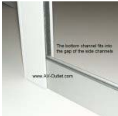
Click Picture for Larger Image