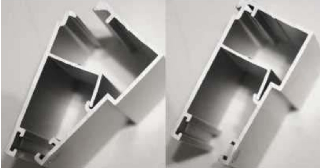
Click Picture for Larger Image