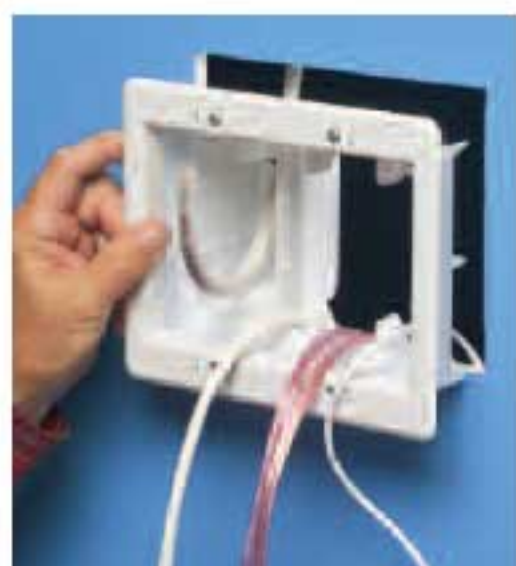
2 Attach trim plate to box. Install box assembly in opening.