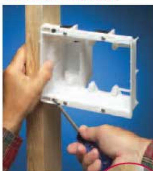
1 Attach box to stud. Note tabs for proper positioning of box for drywall.