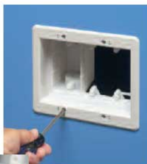
4 Tighten mounting wing screws to pull the box securely against the wall board.