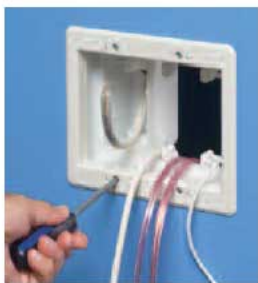
3 Tighten mounting wing screws to pull the box securely against the wall board.