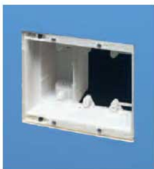
2 Install wall board.