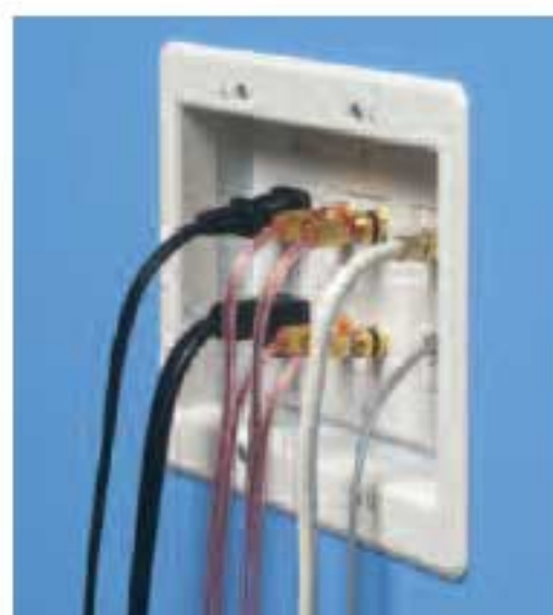
4 Finished installation. Power in one side; low voltage in two openings.