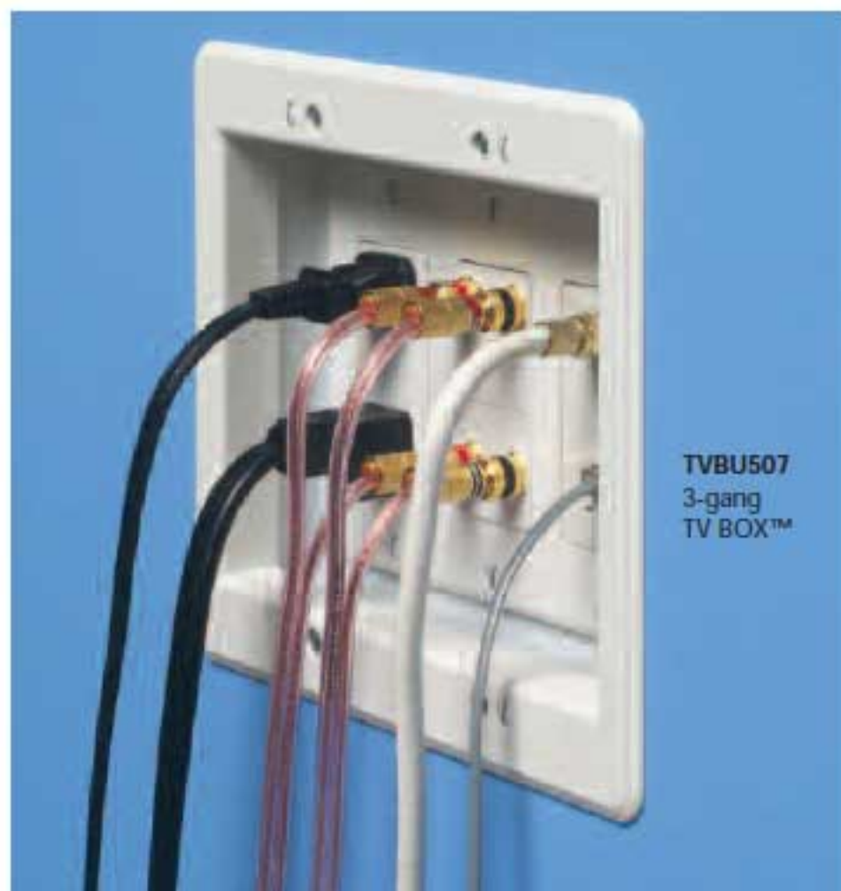
TVBU507 3-gang TV BOX™