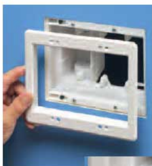
3 Attach paintable trim plate with screws provided.